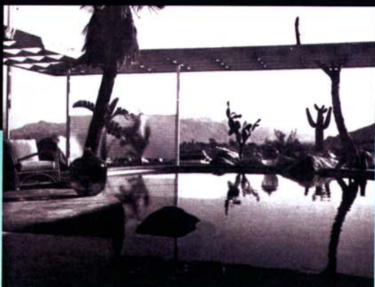
"The pool viewed from the living room produces a striking picture of contrasts between smooth water and irregular landscape."