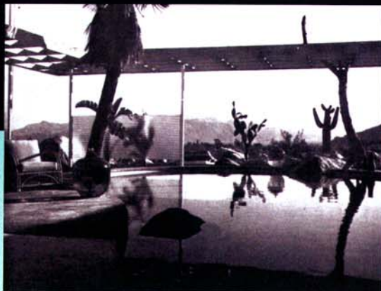
"The pool viewed from the living room produces a striking picture of contrasts between smooth water and irregular landscape."